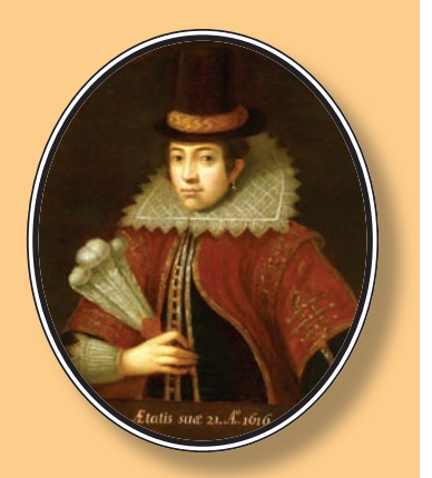
Portrait of Pocahontas